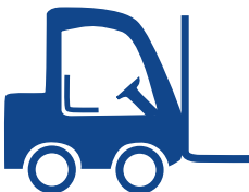
Pick and Pack